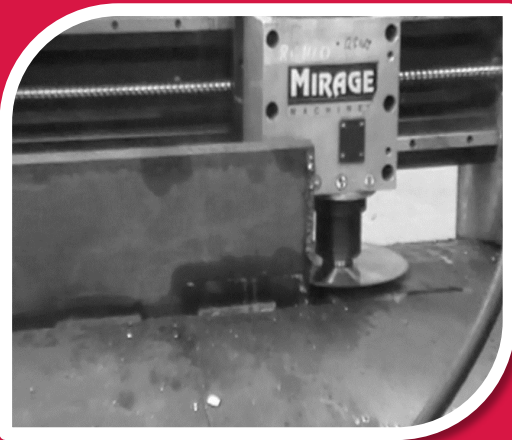
Workshop trials using the Mirage MR2000.