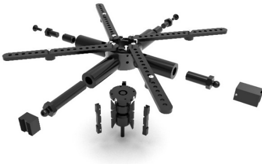
Exploded view showing all base components, collet mount and setting straps.